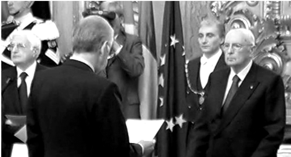
Mario Monti has unveiled a new, technocratic cabinet meant to steer Italy through its debt crisis after the fall of Silvio Berlusconi's government.

Mr Monti, who has now been sworn in, appointed a banker to lead a super-ministry of development, infrastructure and transport.