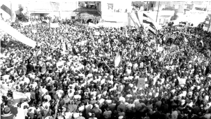
Syrian army defectors attack a military intelligence base near Damascus, opposition groups say, in what would be their highest-profile attack so far.

What to order: Go for the Skinny Sesame Bagel with light garden veggie cream cheese. It has just 310 calories. Even better, swap the cream cheese for hummus, which has heart-healthy fat, satisfying protein, and 20 percent of the iron you need for the day.