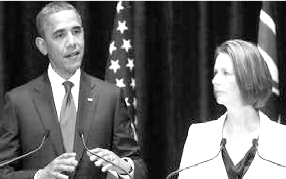
US to send marines to Australia The US is to begin deploying 2,500 military personnel to Australia to boost security in the Pacific region, President Obama says on a visit.