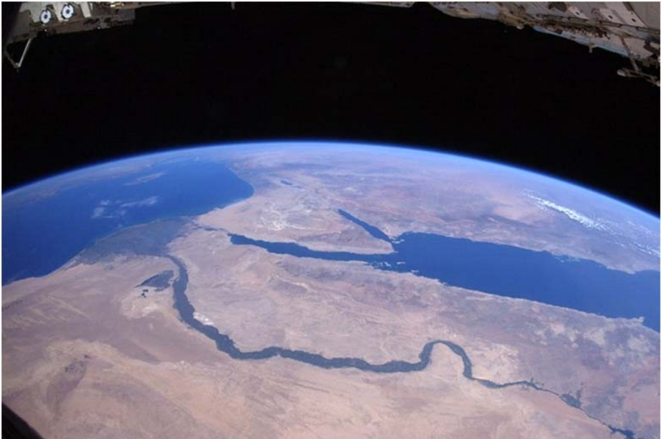
Over the Sahara desert, approaching the ancient lands and thousand-year history. River Nile flows through Egypt by the Pyramids of Giza near Cairo. Further, the Red Sea, Sinai Peninsula, Dead Sea, Jordan River, as well as the island of Cyprus in the Mediterranean Sea and Greece on the horizon.