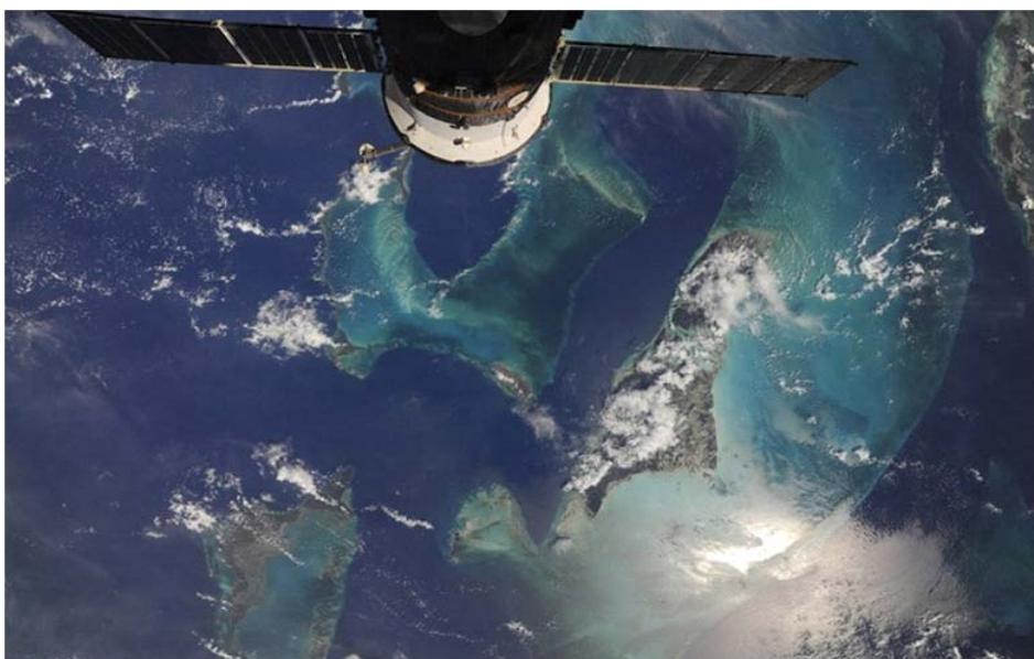
Of all the places of our beautiful planet few can rival the beauty and richness of colors in the Bahamas. In this photo, our ship is seen against the backdrop of the Bahamas.

For more information, visit http://www.nationalhellenicmuseum.org or call 312-655-1234. Follow NHM on Facebook and Twitter !