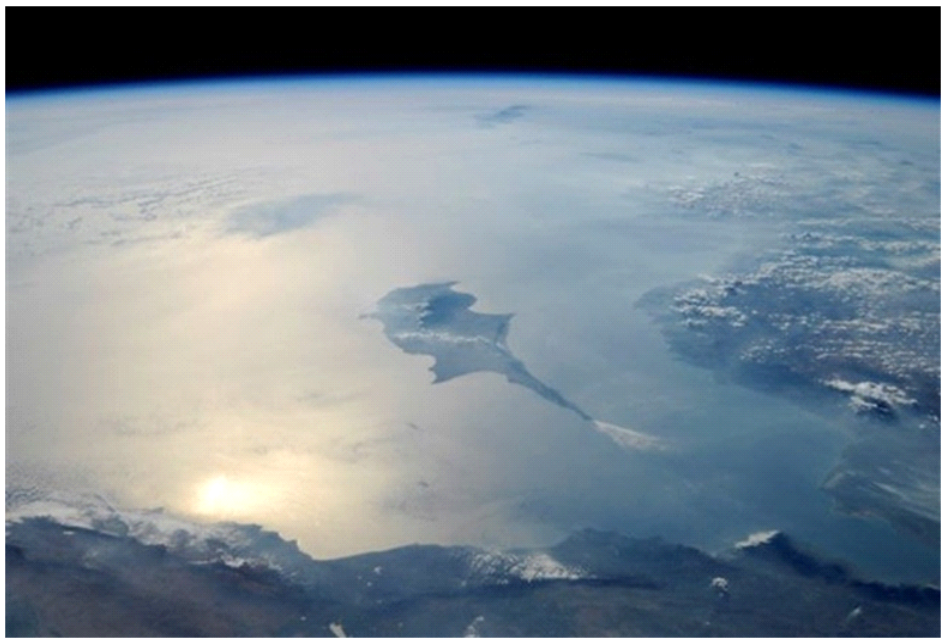
Perfect reflection of sunlight showing Cyprus .