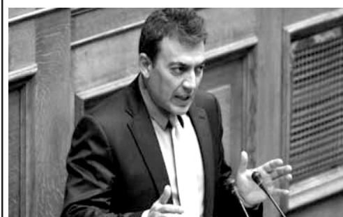
The Greek labor market expanded by almost 20,000 salaried jobs in December, Labor Ministry data showed on Monday, with minister Yiannis Vrontsis expressing optimism that unemployment will start contracting within 2014.

TODAY IS THE OLDEST YOU'VE EVER BEEN, YET THE YOUNGEST YOU'LL EVER BE, SO ENJOY THIS DAY WHILE IT LASTS.