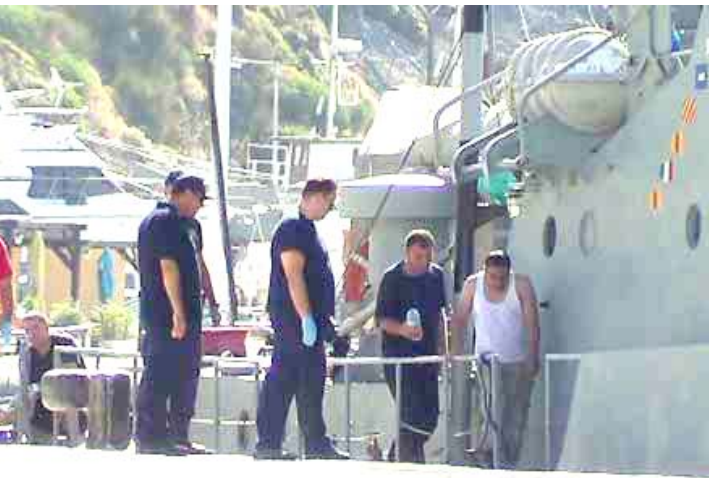
Two migrants were found dead and 11 rescued late on Thursday after the boat they were sailing in from Turkey sank off Samos in the eastern Aegea. Another 22 were thought to be missing.