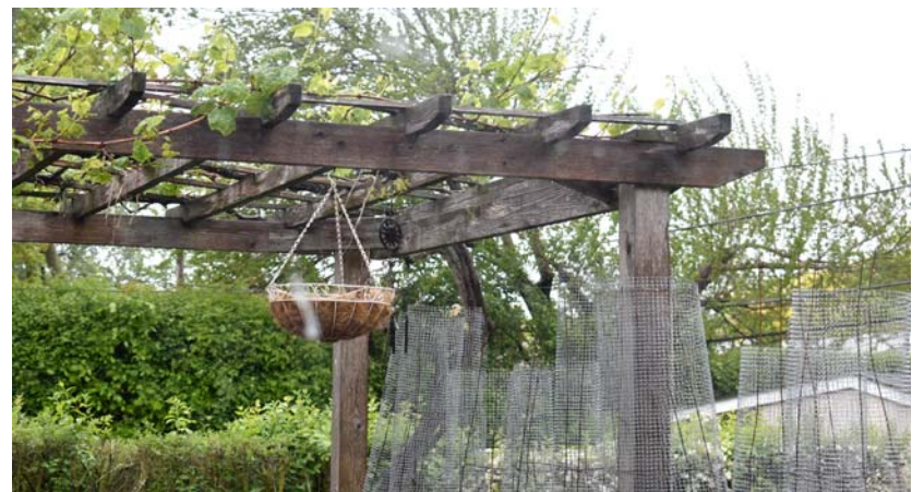
Plenty of grapes in the editor's vineyard..... for the squirrels