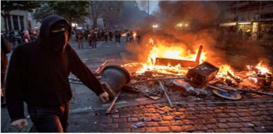
Dozens of protesters were detained after setting fire to vehicles and barricades in Hamburg overnight

Deadlock over climate change between the US and the other nations at the G20 summit appears to have been broken. The BBC understands a compromise final closing text has been agreed at the second day of their meeting in Hamburg. According to an EU official, the text acknowledges President Donald Trump's withdrawal from the Paris climate agreement without undermining the commitment of other countries.