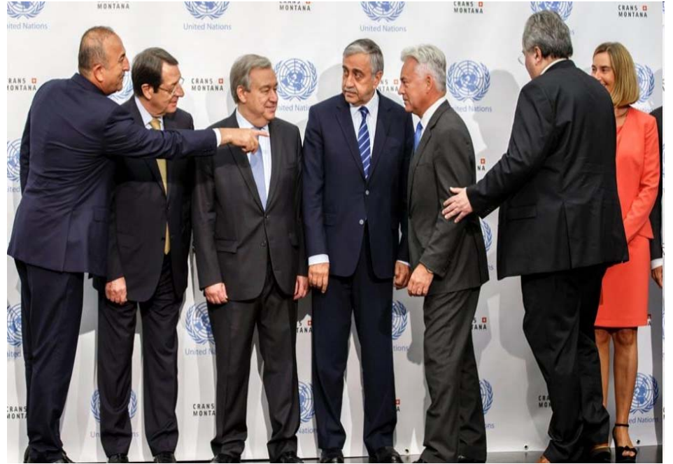
Officials at the Cyprus Conference in Crans-Montana, Switzerland, Thursday (from left to right): Turkish Foreign Minister Mevlut Cavusoglu, Cyprus President Nicos Anastasiades, United Nations Secretary-General Antonio Guterres, Turkish-Cypriot leader Mustafa Akinci, UK European Affairs Minister Alan Duncan, Greek Foreign Minister Nikos Kotzias and European Union foreign policy chief Federica Mogherini. The UN chief returned to the Swiss resort Thursday in a bid to break the deadlock in reunification talks between Greek and Turkish Cypriots.