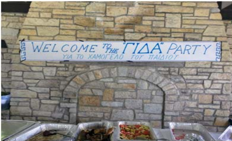
About fifty or so octogenarians gathered and enjoyed the famous boiled "gida" or "Giosa" the kind of meat we grew up with and recently the Greeks "rediscovered"