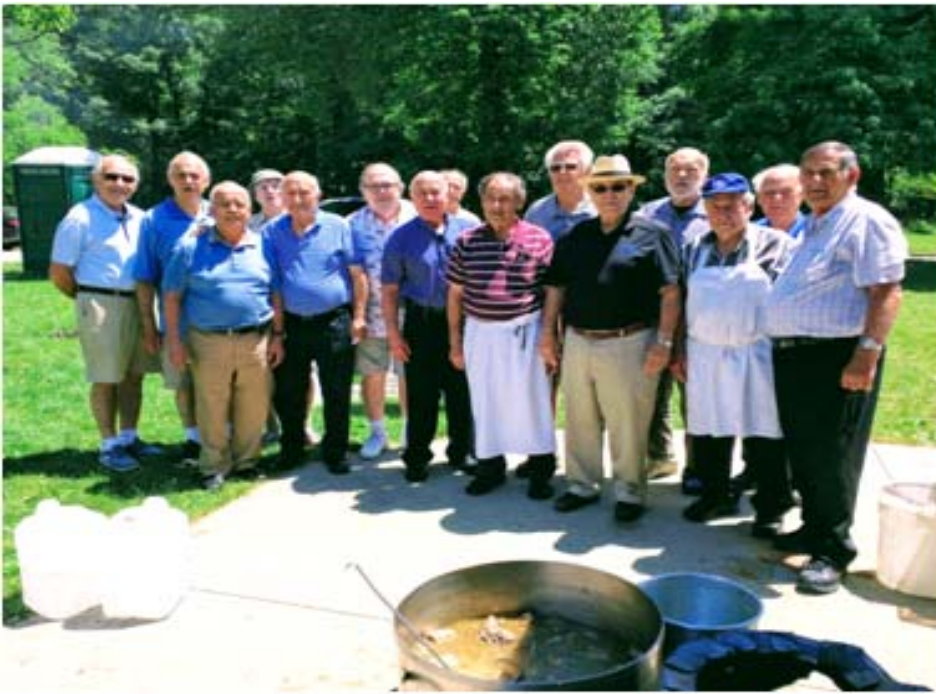
This year the Editor missed the "Γίδα" party, an annual gathering where few goats are consumed to support "το χαμόγελο του παιδιού" στην Ελλάδα.

THE FAMOUS "GIDA PARTY" FOR THE "ΧΑΜΟΓΕΛΟ ΤΟΥ ΠΑΙΔΙΟΥ"