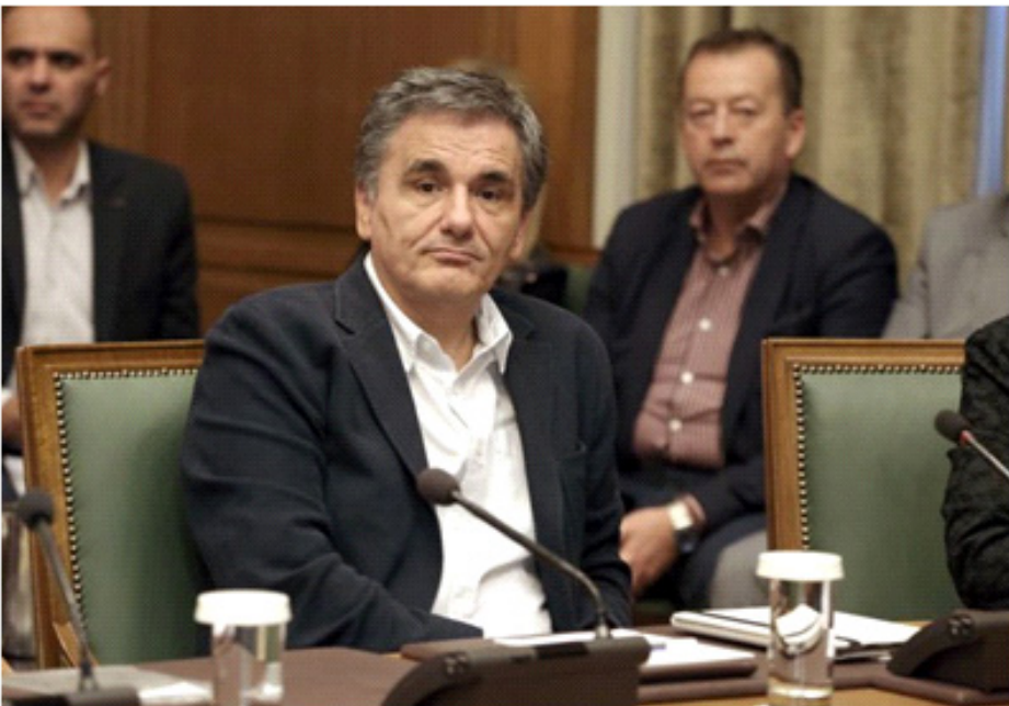
Greek Finance Minister Euclid Tsakalotos (C) attends a meeting with Greek cabinet ministers at the parliament in Athens, Greece, 16 October 2018.

Representatives of the civil service believe that the wage hikes are of a pre-electoral, and trade unionists nature, as the increases are being offered only to newer public servants