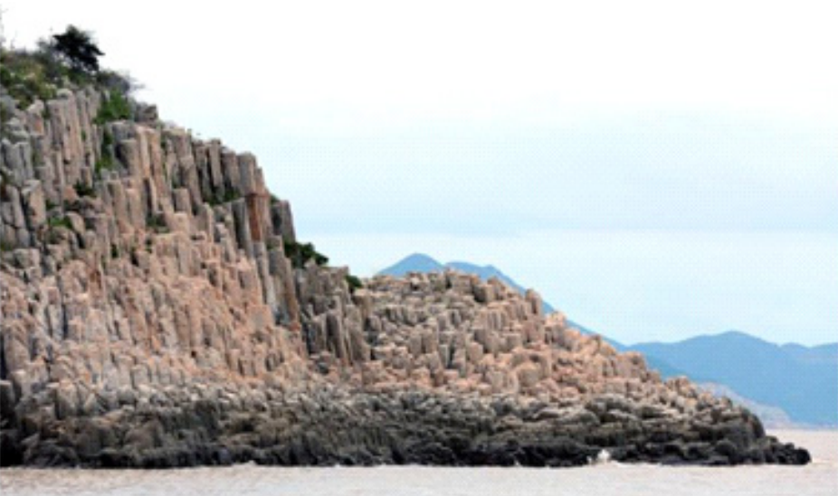
Rising sharply from the East China Sea, a maze of smooth basalt columns forms a surreal stone forest.