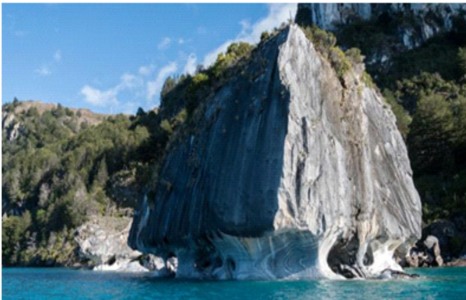
Deep in the remote reaches of Patagonia, a shimmering glacial lake holds a spectacular geological marvel.