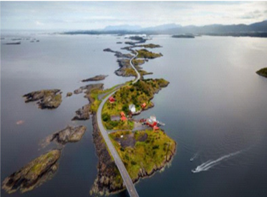
Norway’s stunning marvel of engineering The 8.2km-long Atlantic Ocean Road connects Averøy to mainland Norway, revealing extraordinary views as it hops from island to island.