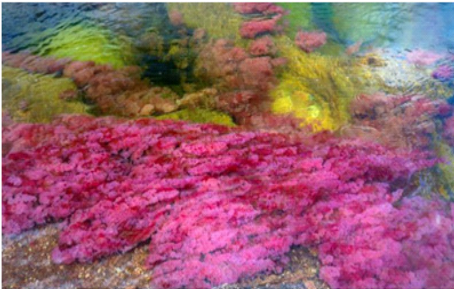
Every year in the remote wilderness of Colombia, an ordinary river erupts into a spectacular rainbow-coloured waterway.